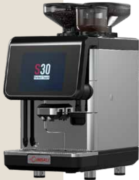
S30 fully automatic