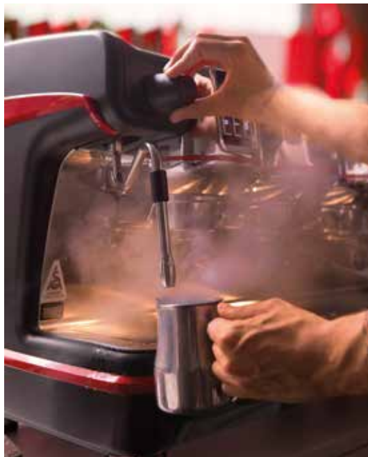
The images include accessories not provided as standard equipment of the machine.

As the true maestro of the M100 Attiva, the barista must be skilled enough to easily complete any operation with a few simple gestures. Most importantly, he must be seen by the public, by his customers, who want the whole experience...a great coffee, a genuine smile and some friendly chat. So the M100 Attiva has a more compact height, leaving more space on top and giving greater visibility to the bartender. A linear feature across the front highlights the machine with a continuous LED light and the cup holder is more streamlined to create a more slender look. So, improved aesthetics, plus, improved