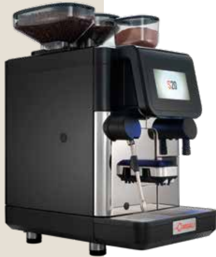
S20 fully automatic