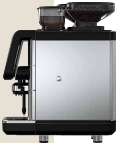
S30 fully automatic