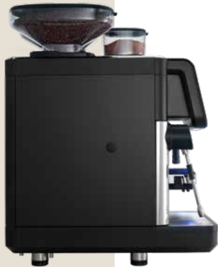
S20 fully automatic